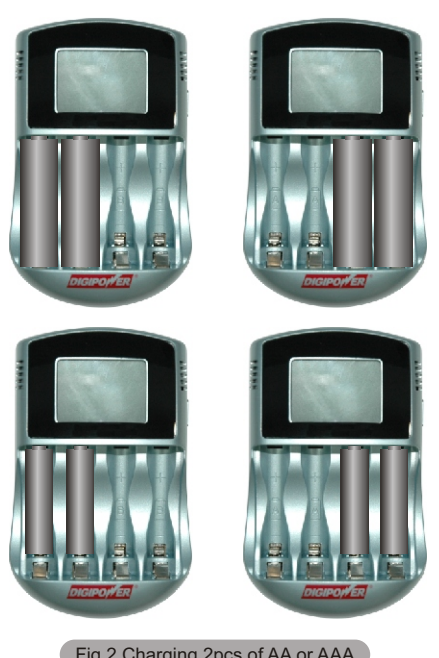
Fig.2 Charging 2pcs of AA or AAA

3.If charging only 2 batteries at a time, place the batteries in the left or right side compartments of the charger.(Fig.2)